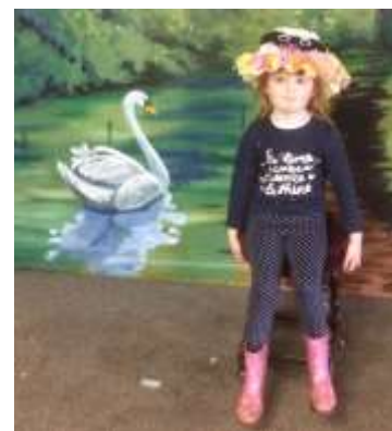
Junior Winner of the 2018 Easter Bonnet Parade

A 7mm/ft 0 Gauge layout, collection of locomotives was once described as a 'motley' one, so it seemed the natural to call a layout upon which to display them, 'Motley'!